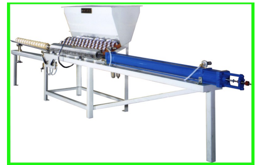
Paper Core Loader

Rewind Paper Core I.D : 26 – 77mm, (1" core is only available on 1.3M unit)